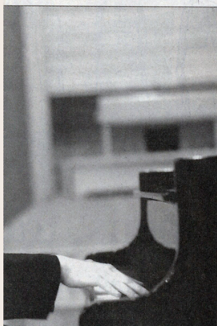
given his performance in 13 countries over the

with the other e would some-performance hout knowing said.